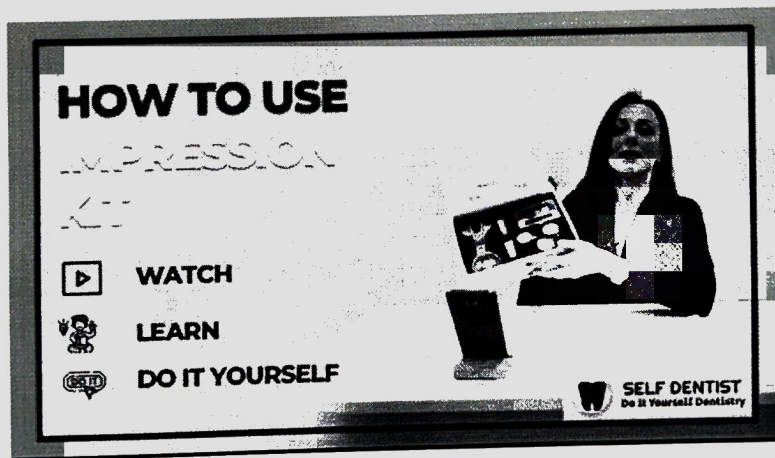
Video - How to use Impression Kit

'Align' is an English word meaning to align. In other words, aligning the teeth and arranging the teeth in an aesthetic way was the main goal of these plates at the beginning. Today, it can be used in a wider range to solve dental problems in a certain framework.